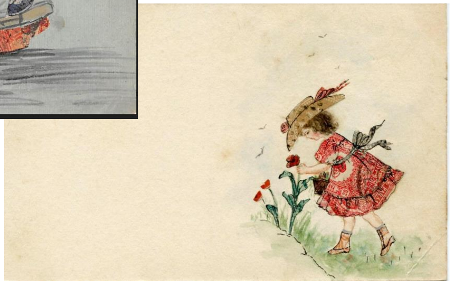
Century-old postcard with watercolour painting of young girl picking flowers, using cut-out of Yugoslavia 20-Paras definitive for her red dress.