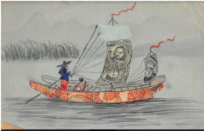
1903-06 postcard with art created with drawing of boatman and portions of stamps cut to form shape of hull, sails, his pants, and woman wearing shawl sitting in front of him.