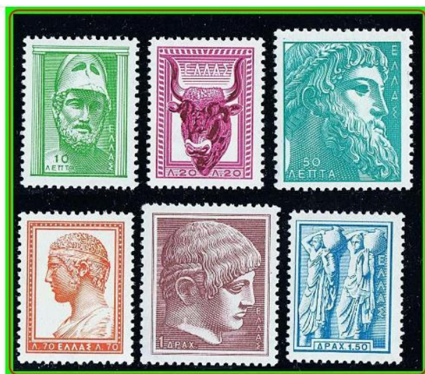
Six 1959 commemoratives issued by Greece featuring ancient sculptures.