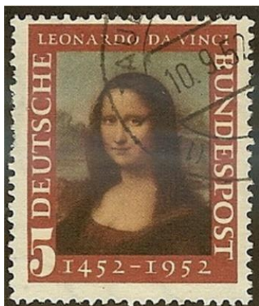
1952 commemorative featuring famous 'Mona Lisa' 1452 portrait by Leonardo Da Vinci, issued by Germany for painting's 500th anniversary.