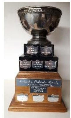
TED ALLEN TROPHY

How will you participate this year? If you have not previously done so, consider participating by building a Single Page, Multi-Page or One Frame Exhibit for this year's club exhibition. For those who have previously participated consider entering an exhibit in more than one class or add an additional exhibit for display only.