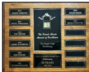
FRANK ALUSIO TROPHY