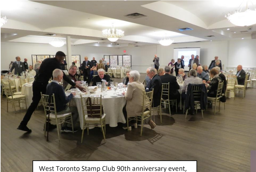
West Toronto Stamp Club 90th anniversary event, 'Renaissance By The Creek' banquet hall, Mississauga, Ontario.