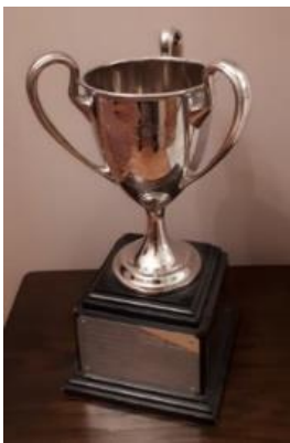
EVERETT DRAKE TROPHY

Please have your contribution in PowerPoint format. If you need help, contact Garfield at garfield.portch@gmail.com