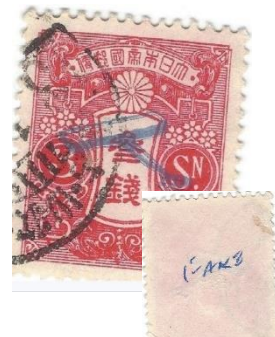
Japan 1919 - fake overprint

Here are a Few: Face, the front of a stamp; Facing slips are authorized printed forms or plain paper pieces with the address of mail Forwarded to other post offices; Facsimiles are copies of stamps not intended to be mistaken for genuine issues; a Fake is a genuine stamp altered to improve its value, with Fresh gum, different perforations or an overprint; a Forgery is a bogus stamp made to sell to a collector; a Postal Forgery is an optional term for a counterfeit, produced to defraud a postal service; a Fantasy resembles a real stamp; Fading describes softened colours on a stamp’s surface; Faux, French for Forgery, often used to describe a counterfeit; Falsch, German for Forgery, often used to describe a counterfeit; a First Day Cover is an envelope processed with a stamp postmarked with its first issue date; a First Flight cover is a postmarked envelope bearing text and sometimes images identifying it having been transported on an inaugural airplane passenger flight; a Favor cancel applied to a stamp or cover by a postal clerk Fulfilling a collector’s request —