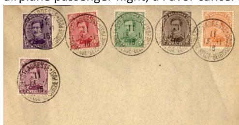
Unaddressed Belgium 1916 Favor cover with carefully-applied postmarks on King Albert I definitives

usually handed back once postmarked; a Fraudulent cover is an envelope prepared for deception, with a stamp cancelled by a back-dated postmark; a Field Post Office is a military postal service designation often used on a postmark; Feldpost is a German equivalent; a Filler is a damaged stamp collected to Fill an album space, often because of its low cost; a Fiscal cancel applied to a postage stamp attached to a document or cover as a revenue-raising tax receipt; a Flag cancel was based on a country’s flag; a Flaw describes a variety caused by a printing defect; Fluorescence is an optical brightener on paper, which glows whitish-violet when exposed to ultra-violet light; Fly-speck refers to a minor stamp variety; Foil stamps have been printed on metallic surfaces, usually to attract