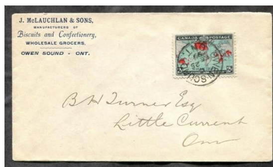
Canada Christmas Map #86b (deep blue) on McLaughlin Biscuits Cover. Owen Sound circular date postmark Fe25, 99. Clean and VF. $40

Visit our online stores 24/7 at: eBay: https://www.ebay.com/str/postcardduster Hip: https://www.hippostcard.com/store/postcardduster