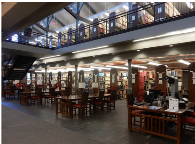
American Philatelic Society Research Library interior at Bellefonte, Pennsylvania

Founded in 1886, the APS is the world's largest non-profit stamp collecting organization. Its stated mission is to promote the hobby to people of all ages, offering services that include knowledge and education, plus access to a vast American Philatelic Research Library (APRL), displays, and a contract post office with an interior on loan from the Smithsonian Institute in Washington.