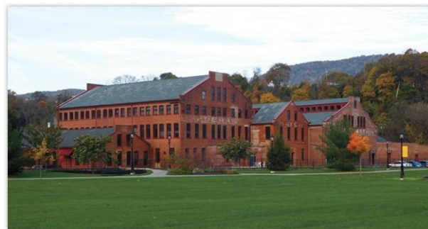
American Philatelic Center in former match factory, Bellefonte, Pennsylvania

"I'll be most happy to share the wonders to be found in a 1,400 volume philatelic Reference Collection of genuine and forged postal artifacts, as well as the joys of managing an Expert Committee of nearly 180 specialized experts. And between Scott and I, we can chat about the many other enticements located at the APC."