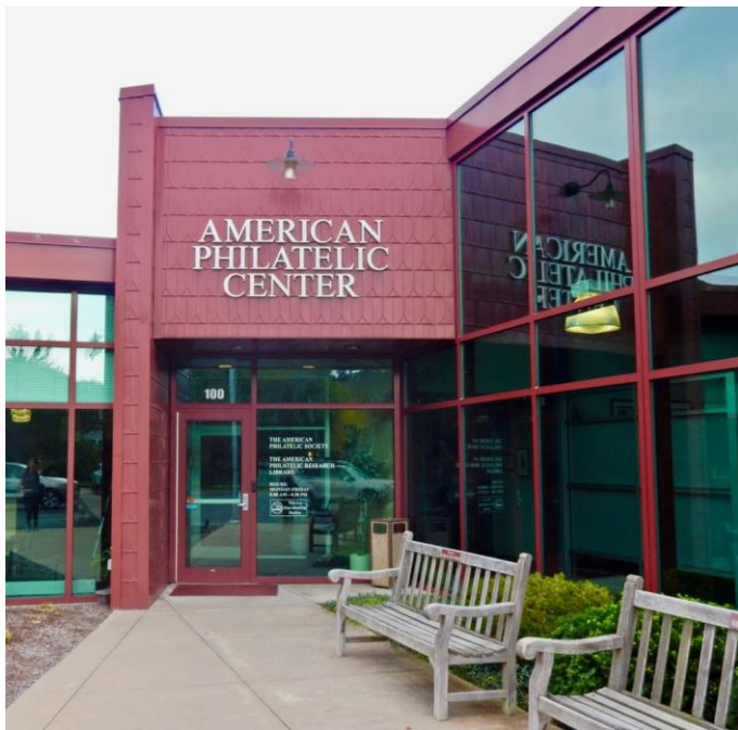
Entrance to American Philatelic Center, Bellefonte, Pennsylvania

With all this in mind, come one and all to the round table at the library of the Fairfield Seniors' Centre, 80 Lothian Avenue, Etobicoke.