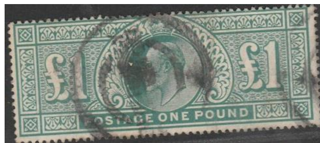
Highest-denomination British stamp depicting King Edward VII, the £1 green was issued with two different watermarks between 1902 and 1913