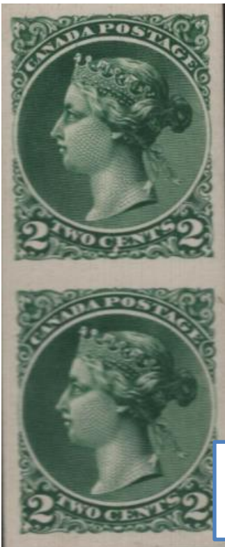
Canada Bank Note Engraving and Printing Company 2-cent Queen Victoria unadopted stamp essay by company formed in 1881 in Toronto, bought in 1894 by the British American Bank Note Company in Ottawa