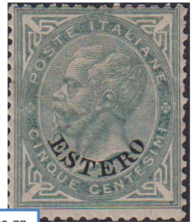
Esterero' overprint on King Victor Emmanuel 1863-77 Italy 5-Centisimi definitive issued for use at Italy post offices in Turkey Levant