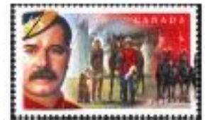
North-West Mounted Police