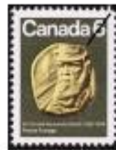
The last spike

The last spike of the Canadian Pacific Railway's transcontinental line was driven into the ground.